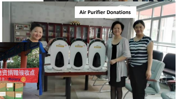
Air Purifier Donations