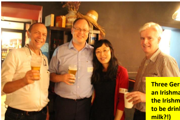
Three Germans and an Irishman (hint: the Irishman seems to be drinking milk?!)