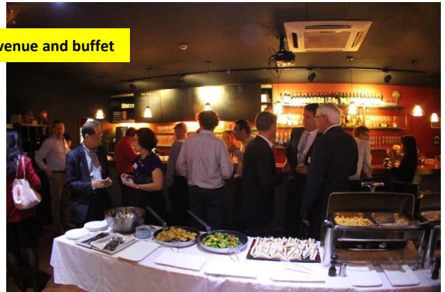
The venue and buffet