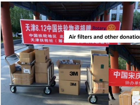
Air filters and other donations